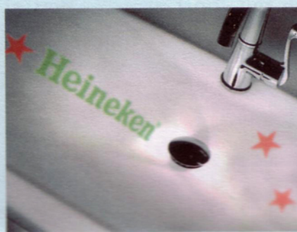
Left: The Meltdown basin features an internal projection system which can project images onto the surface of the basin