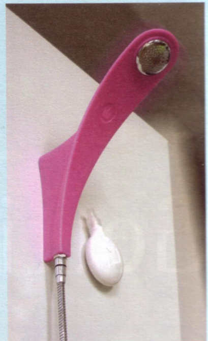
Above: The Attraction shower incorporates a magnetic wall fixture allowing it to be positioned on any metal surface