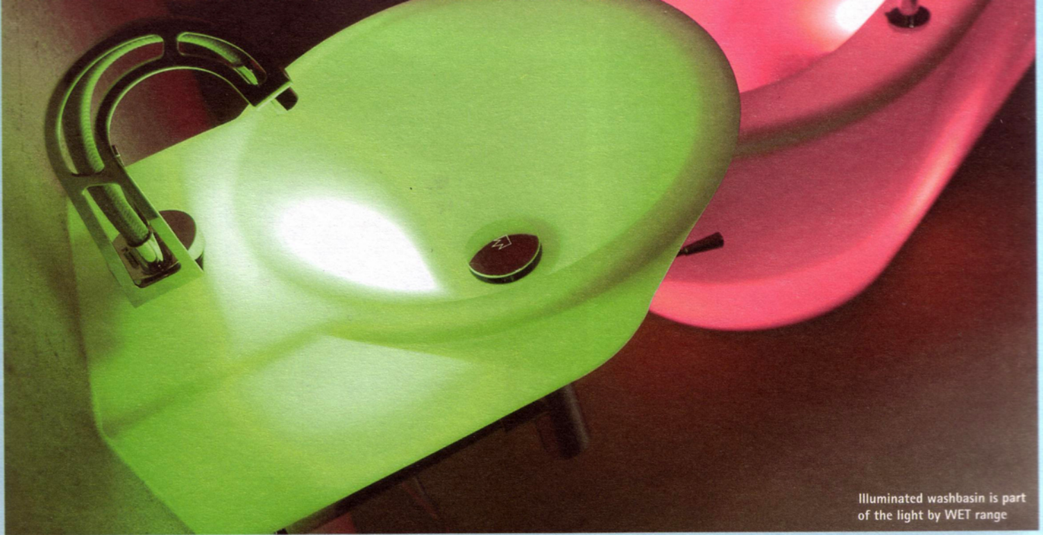
Illuminated washbasin is part of the light by WET range

“[COLOUR] REALLY GIVES LIFE TO PRODUCTS, JUST AS LIVING PLANTS CAN BREATHE COMFORT AND EASE INTO A SPACE”