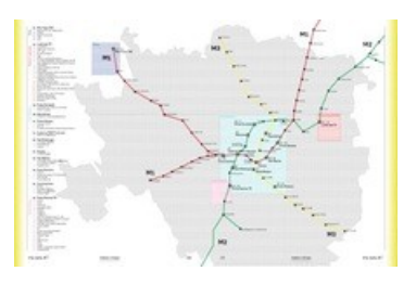
Metro en straatkaart van Milaan met alle Nederlandse presentaties