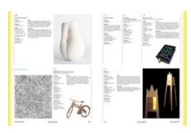
Gidsdedeelte met alle 217 Nederlandse ontwerpers